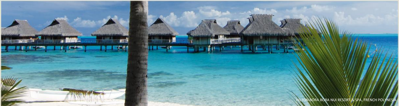
HILTON BORA BORA NUI RESORT & SPA, FRENCH POLYNESIA